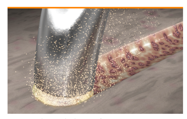
COBLATION plasma technology on soft tissue