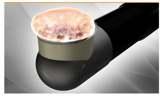
Plasma field formation